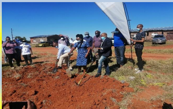
MEC & the Mayor with Councillors- site visit

With a title deed, you have security of ownership and no one will be able to remove you from the comfort of your home. A title deed is proof of ownership and should be kept safe..