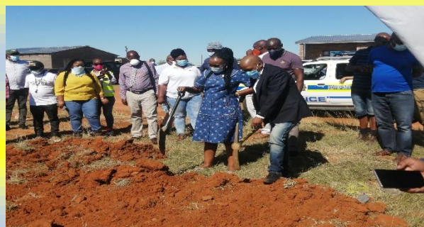
Honorable Mayor accompanied by all Councillors including Management