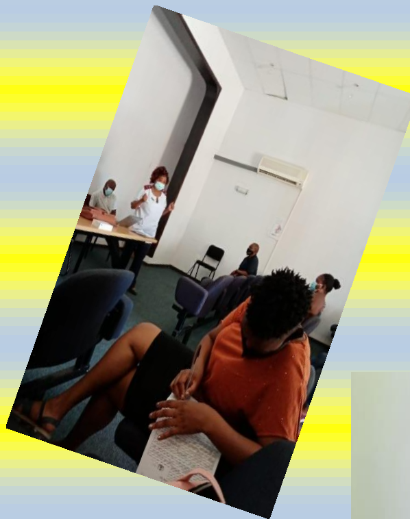
Acting Director: Cooperate Service: Mr